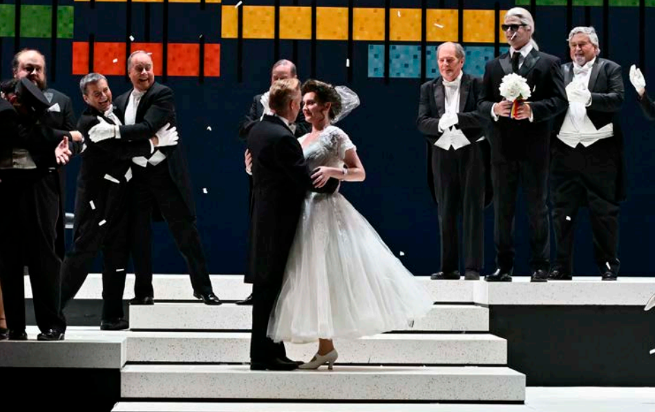
La Cenerentola, 2022.