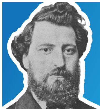
LOUIS RIEL (1844-1885) THE FATHER OF MANITOBA

Louis Riel was the Métis leader and Canadian Member of Parliament who led Manitoba into Confederation and championed the rights of the Métis peoples, their nation, and all Indigenous peoples, Francophones, and ultimately, all minorities.