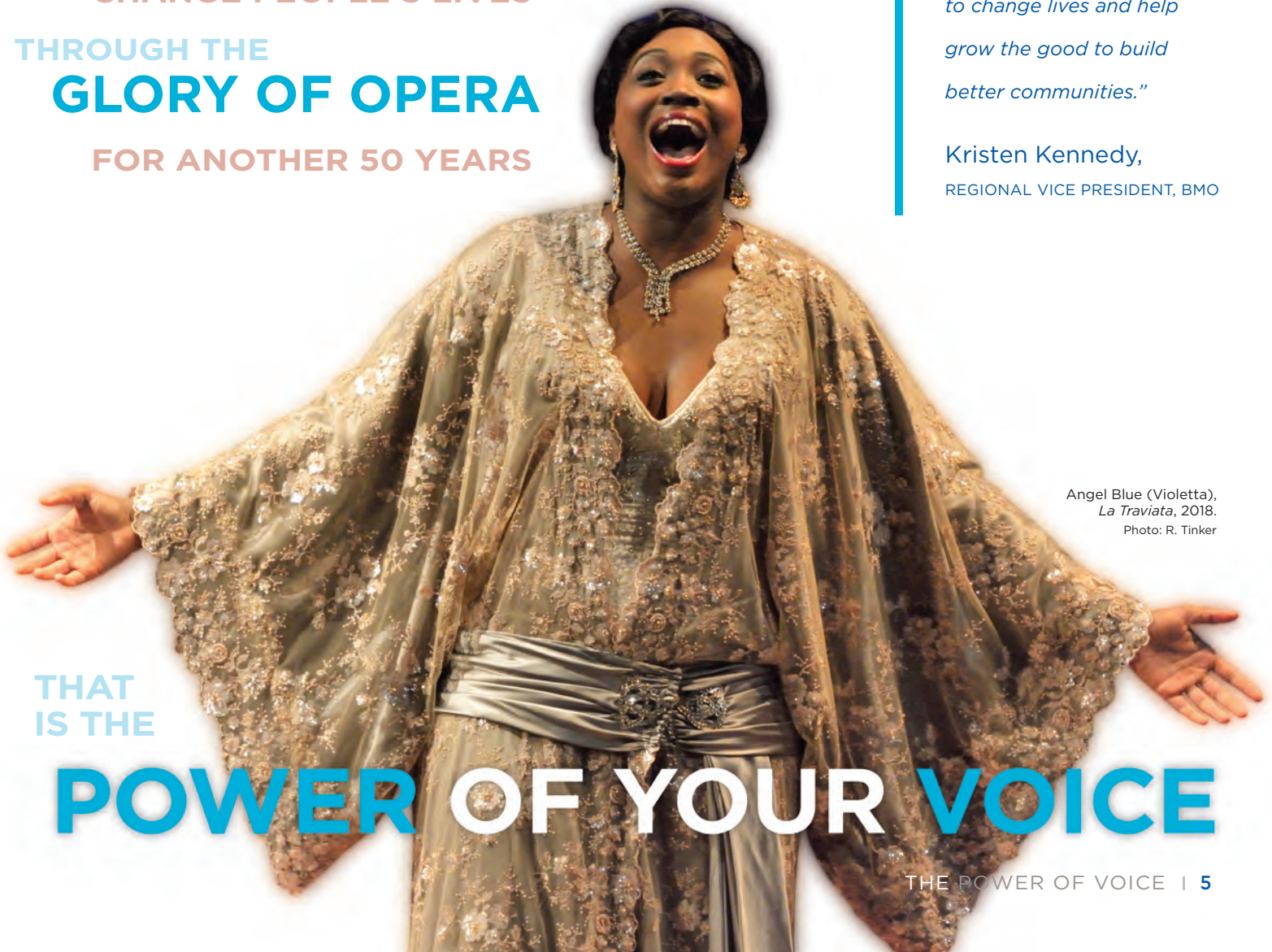
Angel Blue (Violetta), La Traviata, 2018.