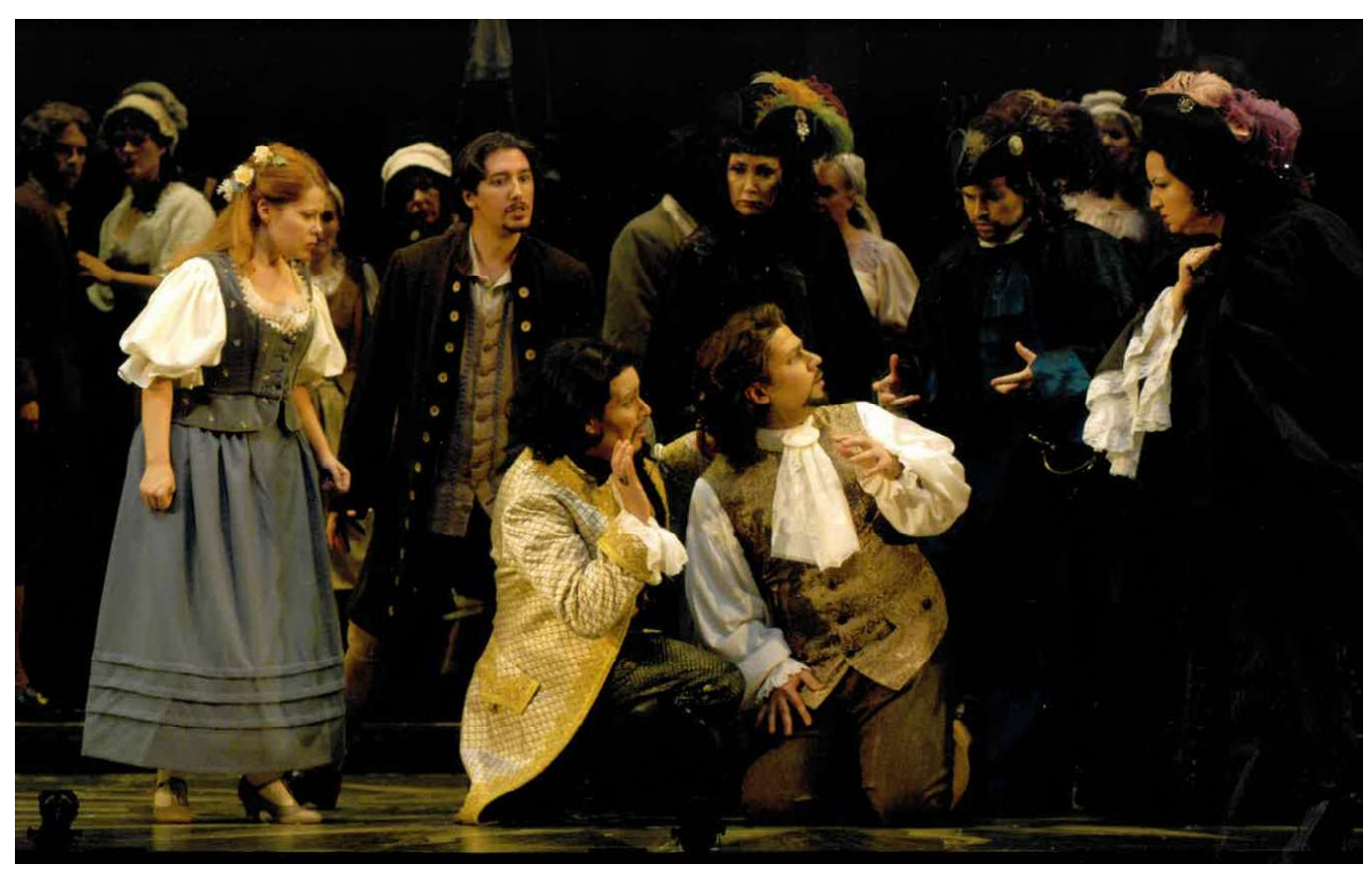
Don Giovanni, 2003, Manitoba Opera.