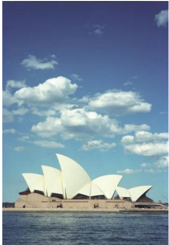
The Sydney Opera House

The story of the opera is written as a libretto: a text that is set to music. Composers write the score or the music for the opera. Sometimes