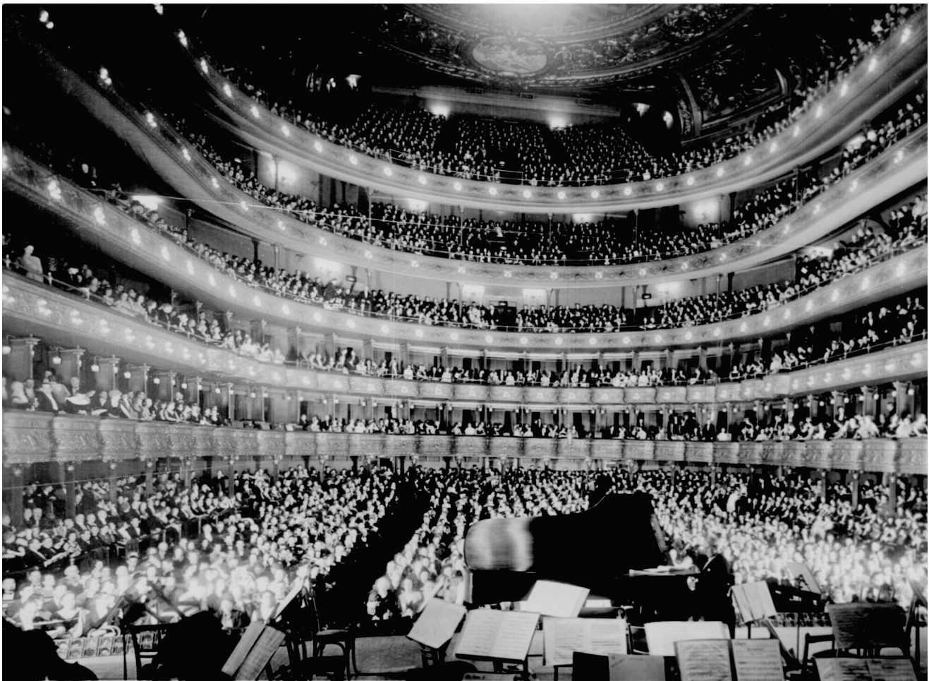
The Metropolitan Opera (1937)

The musical style is another important difference between the two art forms; opera is usually classical and complex, while musicals feature pop songs and sometimes rock and roll. Also, singers in musicals have microphones hidden in their costumes or wigs to amplify their voices. The voices of opera singers are so strong no amplification is needed, even in a large venue. Furthermore, operas are almost completely sung while the use of spoken words are more common to musicals. There are some operas with spoken words and these are called singspiels (German) and opéra-comique (French). Examples are Mozart's The Magic Flute and Bizet's Carmen , respectively.