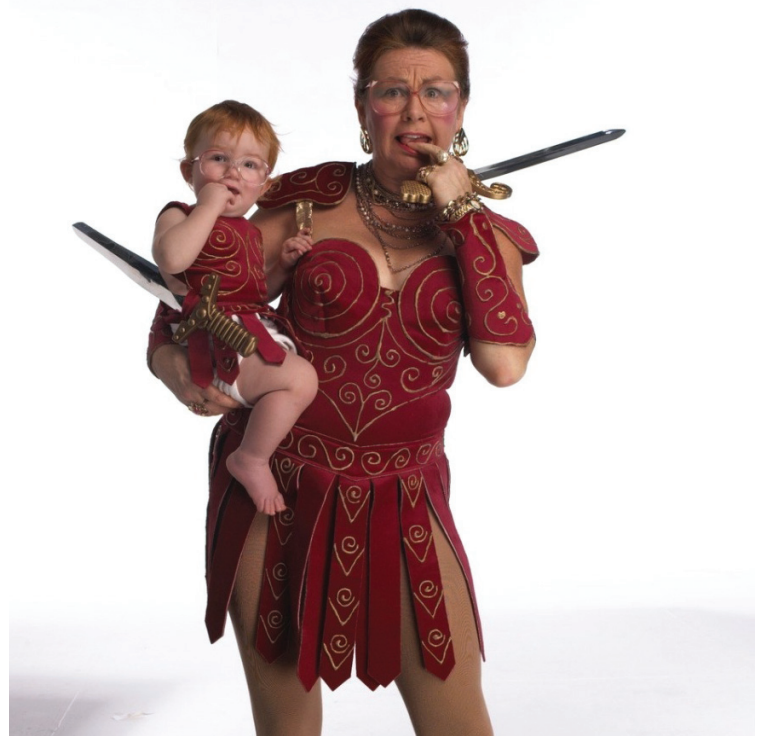
Mary Walsh in character as Marg Delahunty, Warrior Princess.

Earlier this year, Toronto's mayor, Rob Ford called the police on Mary when she approached him for an interview dressed as Marg.