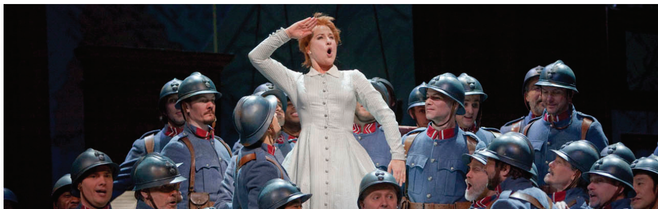
Diana Damrau as Marie in the Metropolitan Opera production of La Fille du régiment.