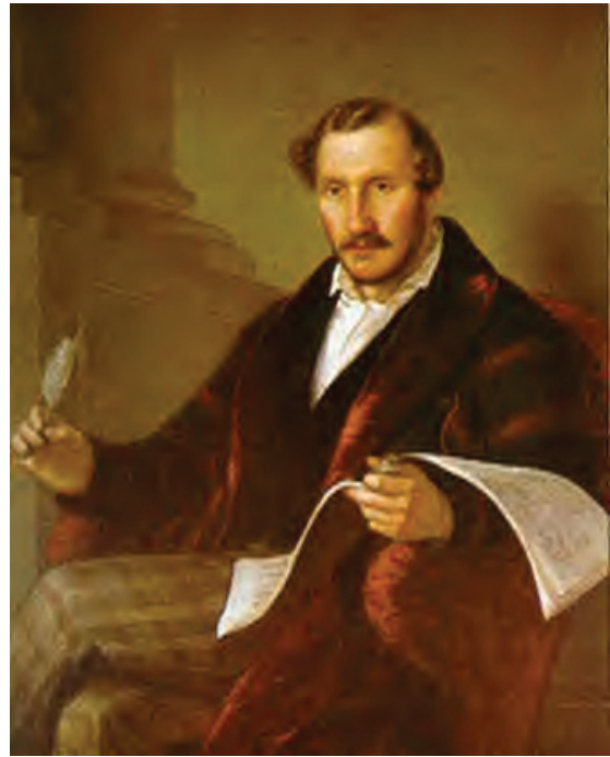
A portrait of Gaetano Donizetti

Gaetano Donizetti, son of a pawnshop caretaker and a seamstress, was born and died at Bergamo, like many of his opera characters, a victim of madness. To the older, baroque-based style known as bel canto (characterized by long, ornamented vocal lines), he added a dramatic urgency, especially in dialogue, that paved the way for Verdi and verismo. Like his colleagues Rossini and Bellini, Donizetti was primarily a melodist. Yet, out of his admiration for the classical masters Haydn and Mozart, he developed a sharp ear for orchestration - unobtrusive but sensitive - and for the dramatic shaping of concerted pieces along symphonic lines.