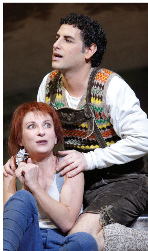
Natalie Dessay and Juan Flórez in La Fille du régiment.