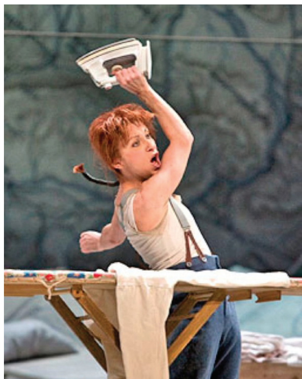
Nathalie Dessay in La Fille du régiment (2008)

La fille du regiment / Donizetti. Virgin Classics, 2008. Call #: DVD 792.542 FI