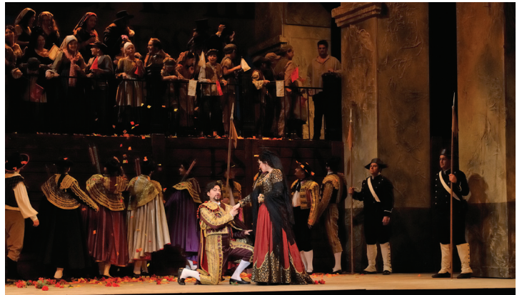
Carmen, Manitoba Opera, April 2010.