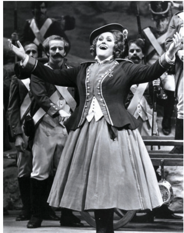
Joan Sutherland as Marie in The Daughter of the Regiment .