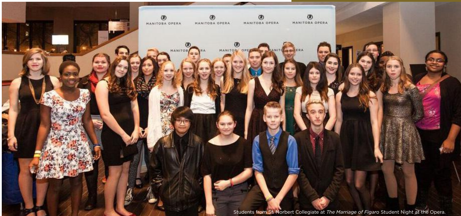
Students from St. Norbert Collegiate at The Marriage of Figaro Student Night at the Opera.