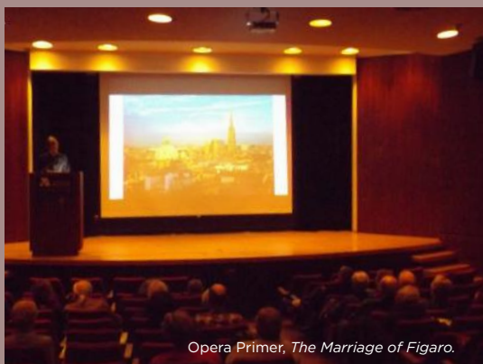
Opera Primer, The Marriage of Figaro .