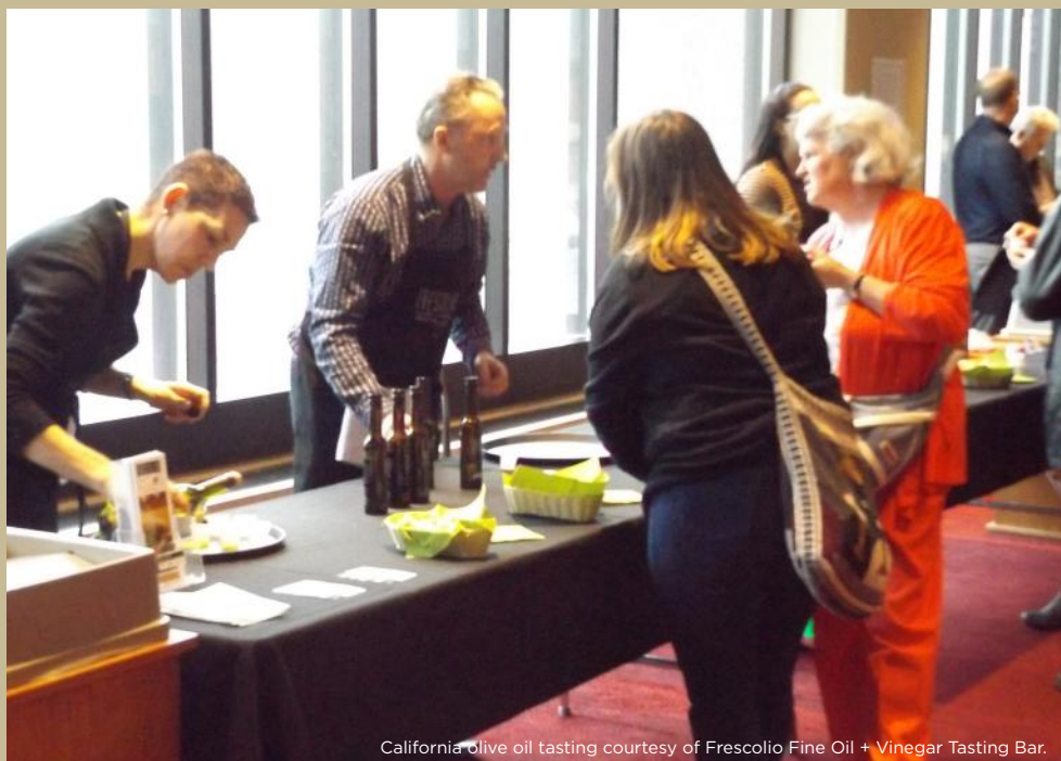
California Olive oil tasting courtesy of Frescolio Fine Oil + Vinegar Tasting Bar.