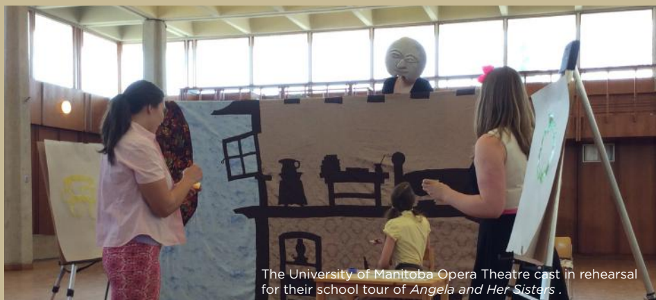
The University of Manitoba Opera Theatre cast in rehearsal for their school tour of Angela and Her Sisters .