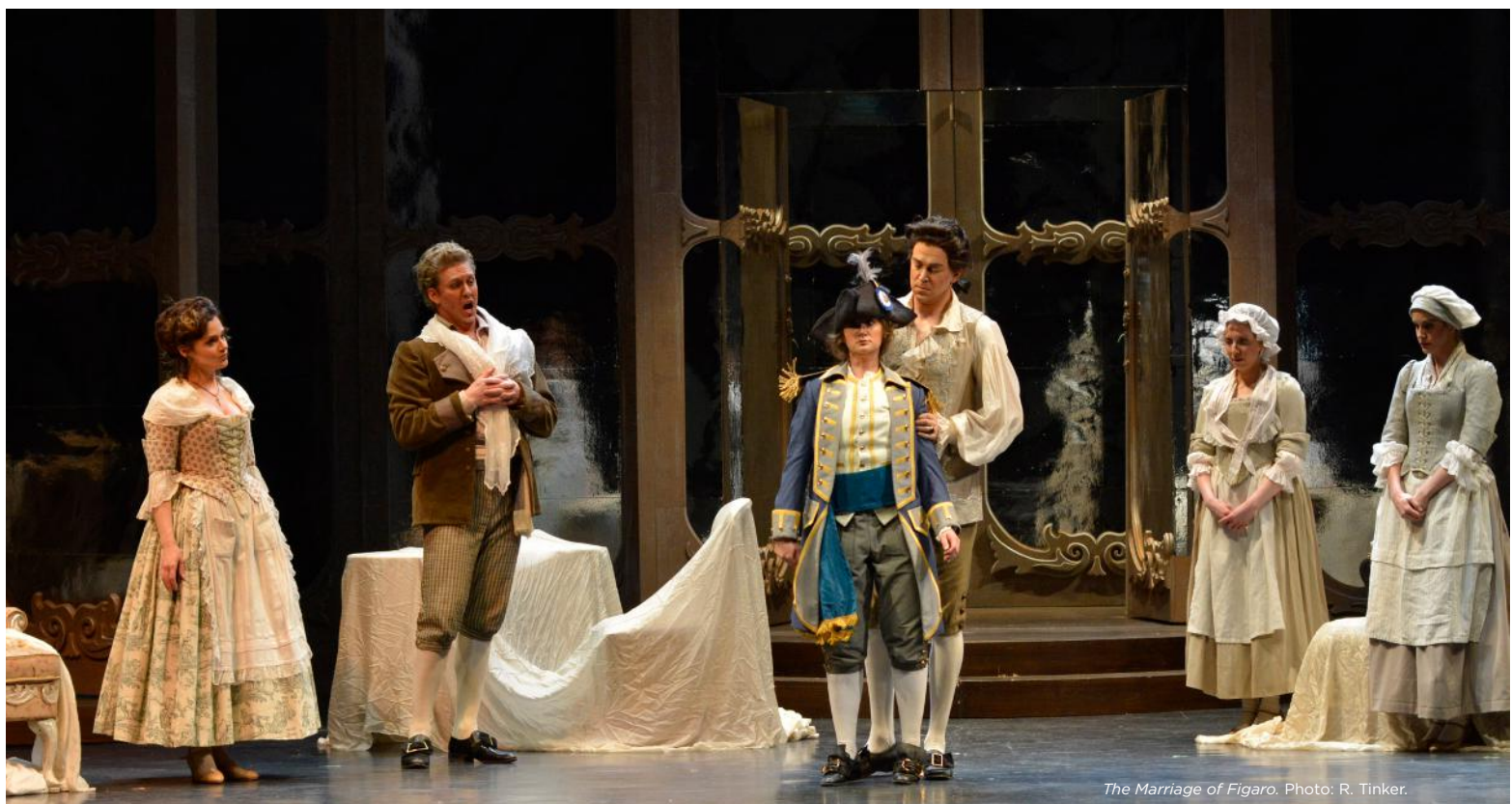
The Marriage of Figaro.