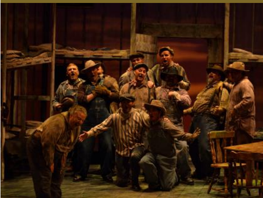
Of Mice and Men.