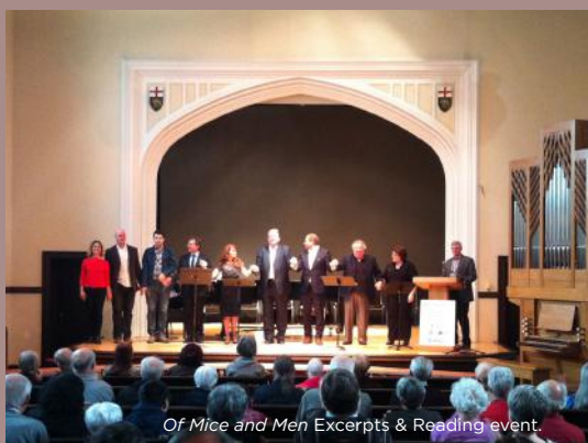
Of Mice and Men Excerpts & Reading event.