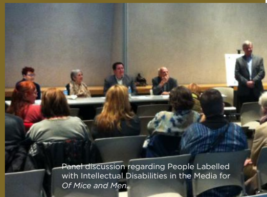
Panel discussion regarding People Labelled with Intellectual Disabilities in the Media for Of Mice and Men

MO’s program included a synopsis written in plain language which takes into account the word count, average grade level accessibility, and average reading ease. The plain language synopsis appeared alongside the regular synopsis to provide patrons with an opportunity to better understand this accommodation right for many people with disabilities. People First of Canada, the national organization representing people labelled with an intellectual disability prepared the synopsis.