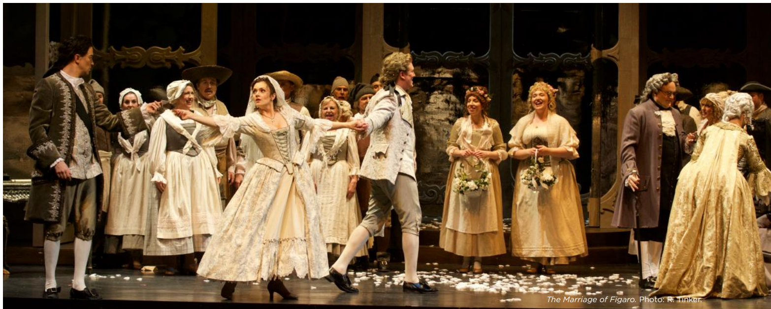
The Marriage of Figaro.