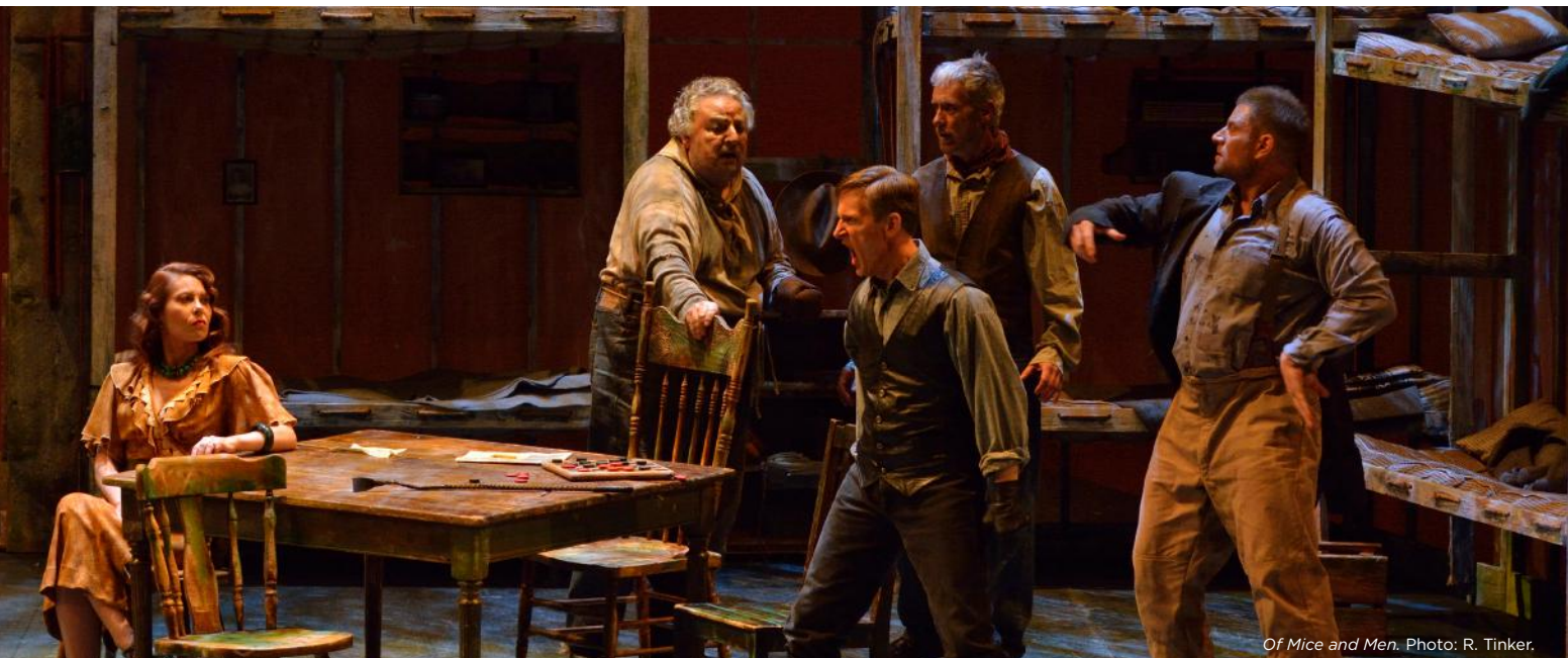
Of Mice and Men.