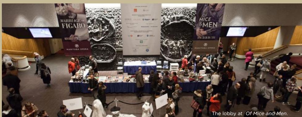
The lobby at Of Mice and Men .

Nominated for four Academy Awards, the classic Hal Roach 1939 version of Of Mice and Men starring Burgess Meredith and Lon Chaney, Jr., was screened on Saturday, April 16, at Cinematheque.