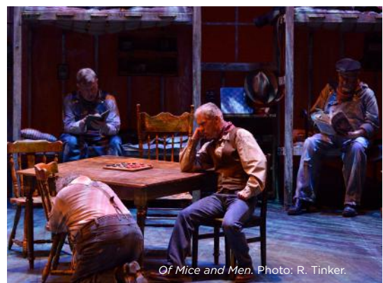
Of Mice and Men.