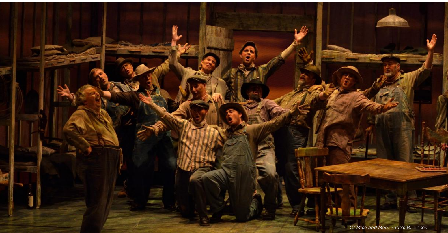
Of Mice and Men.