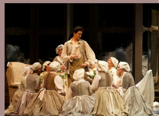
The Marriage of Figaro .